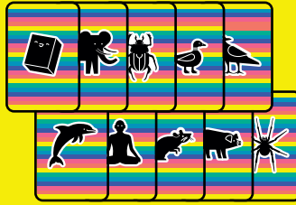
6 silhouette card sets

Take one set of ten different silhouette cards each.